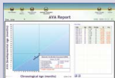
AVA (Automatic Vocalization Assessment)