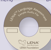
Audio Sample of Child Vocalizations