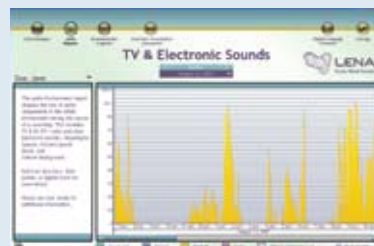
Television and Electronic Sounds